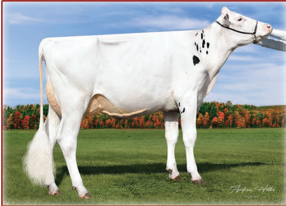
DAM: MS AIJA MIRAND MANDY-ET EX-90