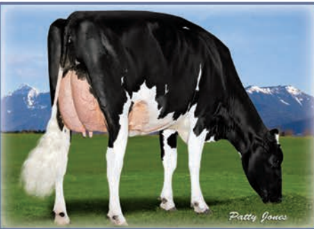
3rd Dam: WESTCOAST COMAND WISCONSIN-ET VG-86 CAN